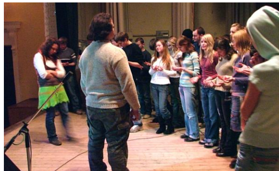
Holy Spirit moving, touching, healing people...